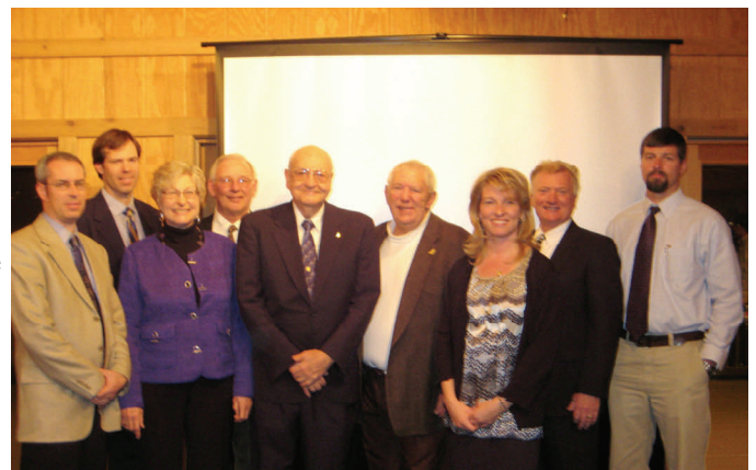
Triton Metal representatives and local economic development officials after announcement